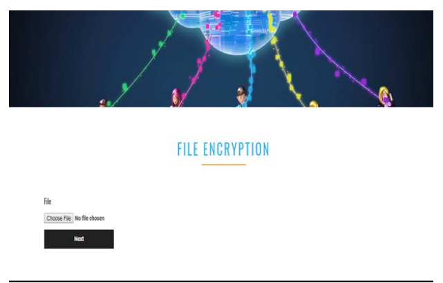
Fig.4: File Upload