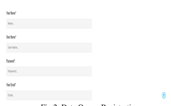
Fig.2: Data Owner Registration