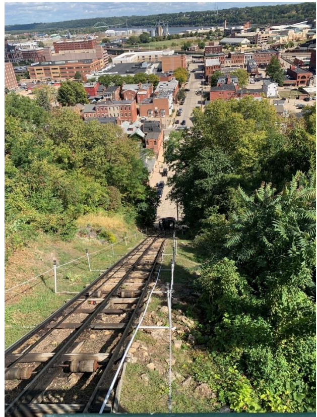
View from the top of the elevator. Iowa is in the foreground, Illinois and Wisconsin are across the river