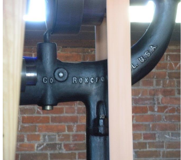
Can you spot the spelling error on the drill press?

local park. We then continued our eastward trek to the Apple Canyon Lake waterfall. This is truly a hidden gem and made a beautiful backdrop for our second photo op.