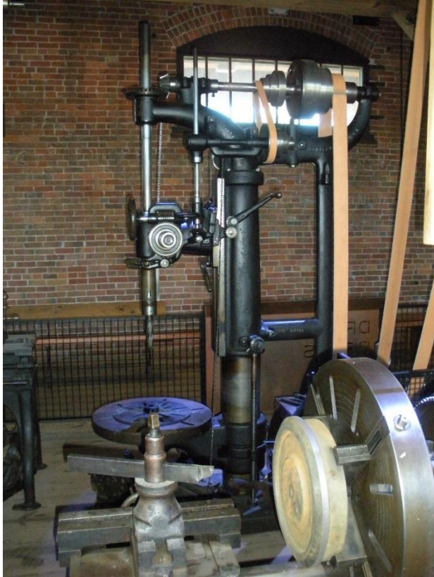
A 1910 drill press made by the Rockford Tool Company