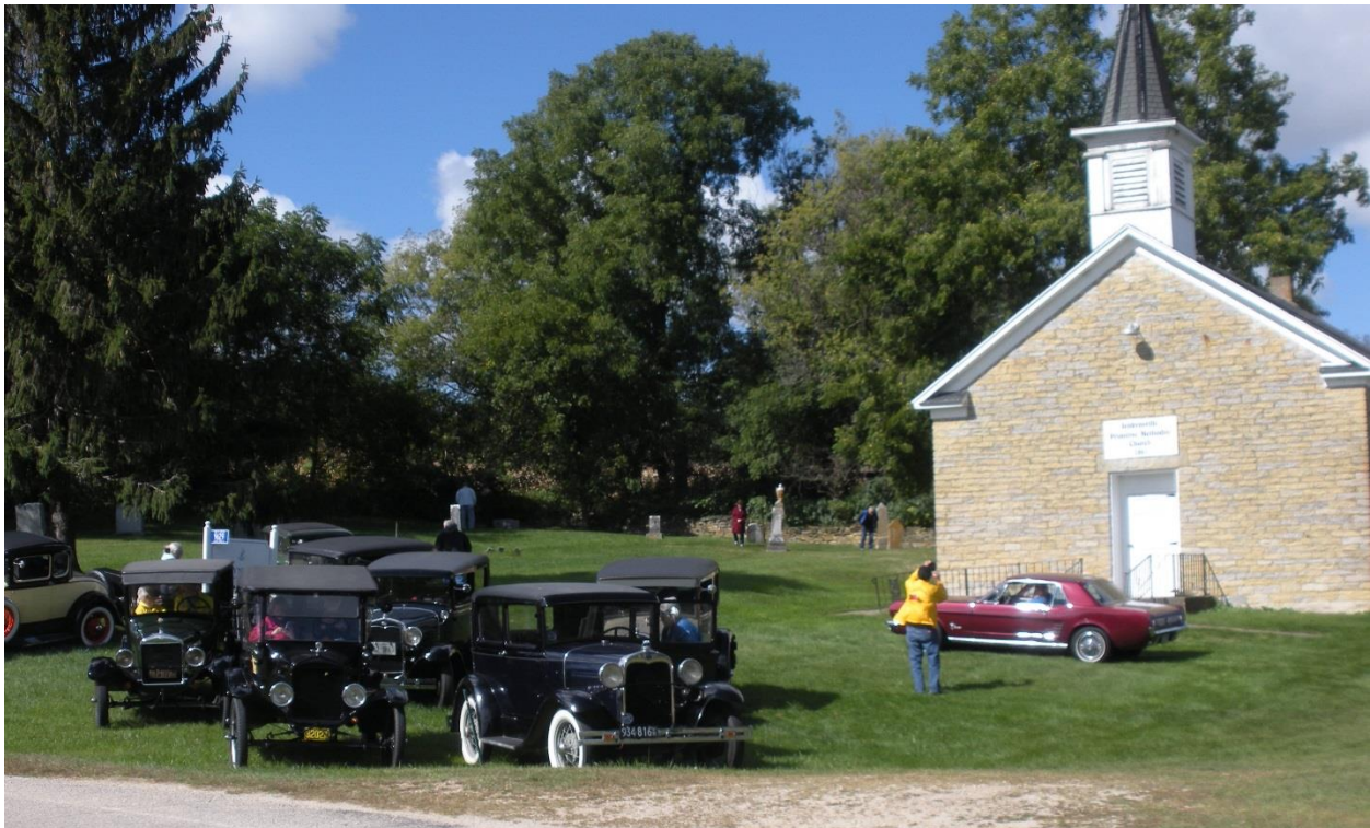
Cars pose for pictures in front of the historic Jenkynsville Stone Church