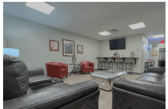
New hangar with a modern lounge

Contact Ike Newton at CAIN Management (205) 999-1485 or ien397@outlook.com to set up a meeting, examine the aircraft and facilities, and discuss the possibilities.