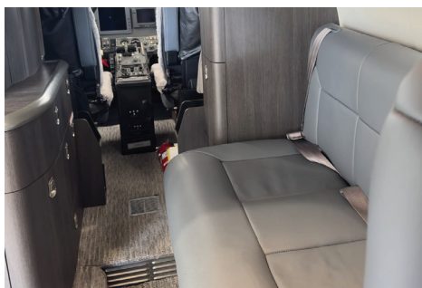
Two Passenger Divan