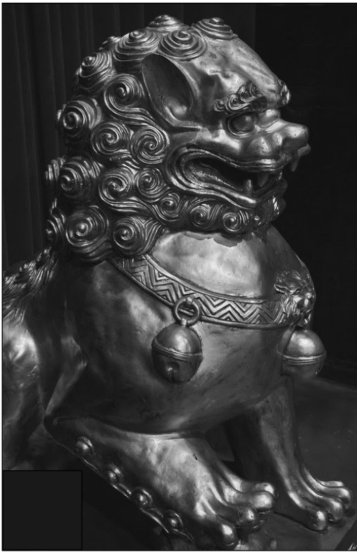
Growl: An antique giant-sized Temple Fu Dog guards the screen in Hollywood Blvd largest auditorium.

You know you are not in a chain theater as soon as you step into Hollywood Blvd.'s lobby, where actual sized photographs of the signed concrete slabs with hand and footprints of the stars in Grauman's forecourt adorn two walls. The bar top features enlarged news photographs of the stars during those ceremonies. Most of the area is a riot of bright colors, Buddhas, reproductions of of Quin Dynasty terra cotta statues of war horses and soldiers, dragon wrapped jars, red-lacquered "Fu Dogs", 200 year old temple doors from rural China, lanterns and silk wall hangings. Thrown in the mix are a pair of life-sized statues of the Blues Brothers, a Chicago favorite.