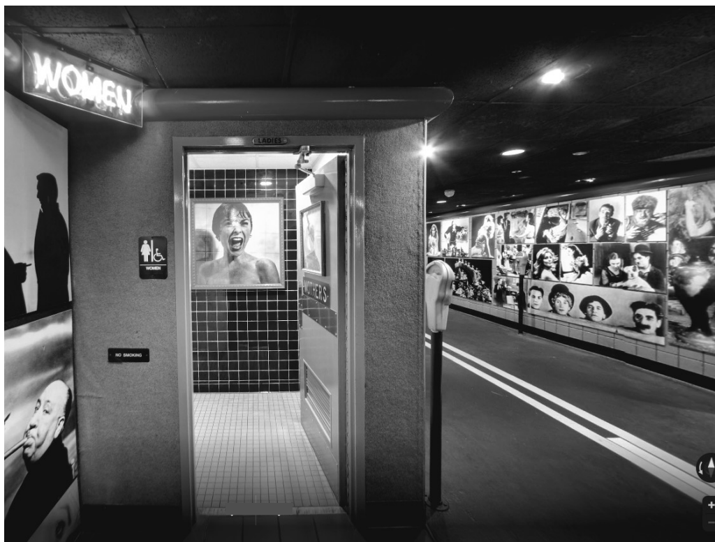
A fine hello: A photo of Janet Leigh in the shower scene from Alfred Hitchcock's “Psycho” greets visitors to the women's washroom at Blvd.