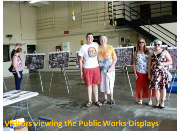
Visitors viewing the Public Works Displays

The Museum has a number of heavy metal Directional signs. Visitors and MGHPs members worked at figuring out their street location.