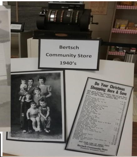
Bertsch Community Store 1940's