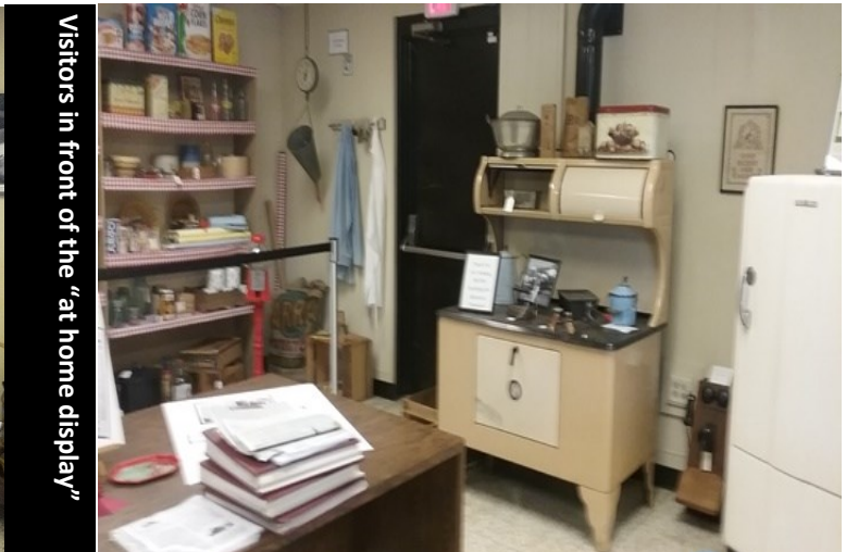
Visitors in front of the "at home display"