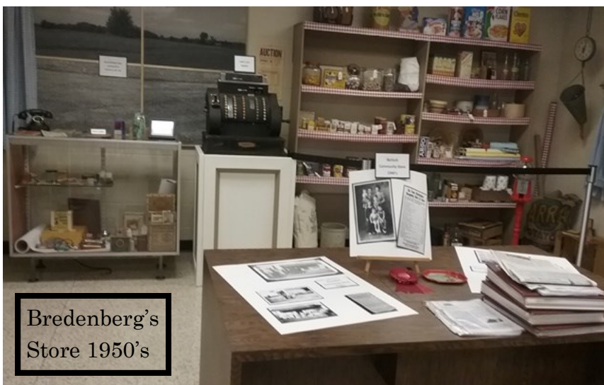
Bredenberg's Store 1950's