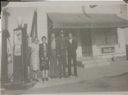
Gambart Store 1930's