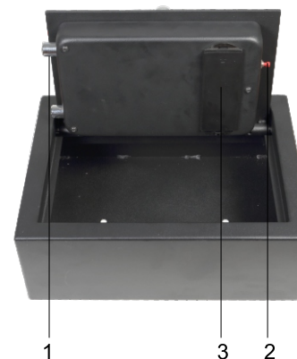
Photo of outside of safe