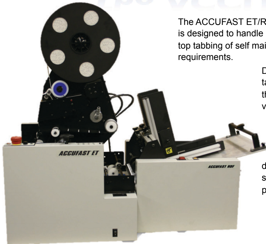
The ACCUFAST ET/R Mail Tabber with the ACCUFAST HDF Feeder

Add to the productivity of the ET/R by using high volume tab sources from ACCUFAST. Either use free standing fan fold boxes or high volume (50,000 1.5 inch) rolls delivered by the ACCUFAST LDM. Reduce tab handling, splicing and threading with ACCUFAST tabs in high volume packages.