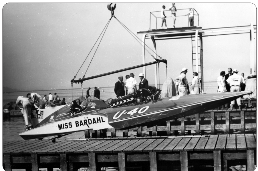
The Miss Bardahl on the sling at Seattle

Answer: Add more oxygen, because it is the burning of fuel and oxygen that produces the power in a piston engine. Air is about 21% oxygen; the rest is nitrogen and small amounts of other gasses. But nitrous oxide is about 37% oxygen, and oxygen is what we need! So,