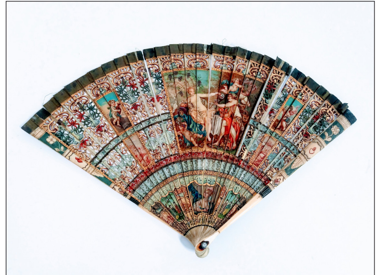
A French antique, hand-painted fan with vibrant colors.