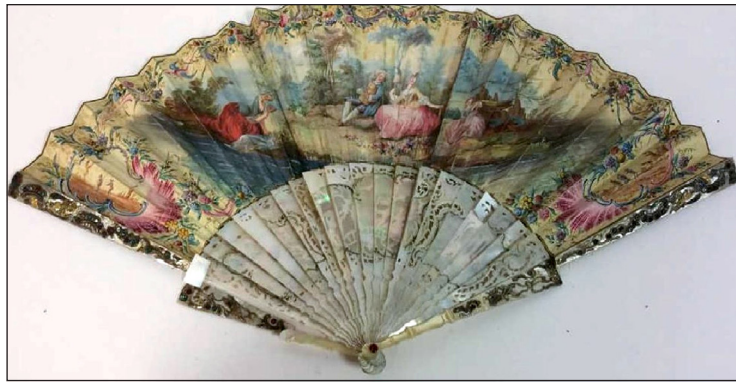
This Boucher antique hand-painted ladies' French fan has mother-of-pearl handles.

In the June auction, equally desirable and striking ladies fans, all antique and hand-painted, are represented, including a Boucher French fan ($200/400), having mother-