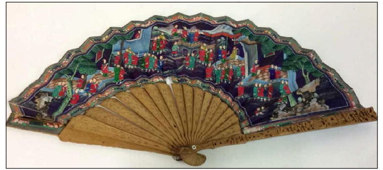
This antique hand-painted silk wood folding fan will cross the block.

The Fan Museum in London has a collection of more than 5,000 fans and fan leaves originating all over the world. "Few art forms combine functional, ceremonial and decorative uses as elegantly as the fan. Fewer still can match such diversity with a history stretching back at least 3,000 years," according to the muse-