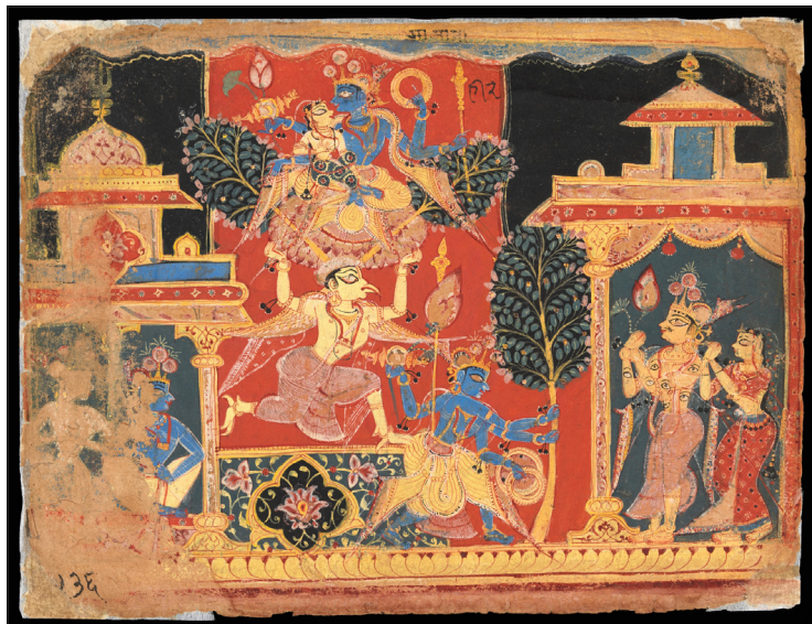
"Krishna Uproots the Parijata Tree, Folio from a Bhagavata Purana (Ancient Stories of the Lord)" by unknown artist, Indian, 1525-50, opaque watercolor and ink on paper, 7¼ by 9½ inches (unframed), Accession # EX.2018.6.2, Los Angeles County Museum of Art, From the Nasli and Alice Heerama-neck Collection, Museum Associates Purchase

The Getty Center is at 1200 Getty Center Drive. For additional information, 310-440-7300 or www.getty.edu .