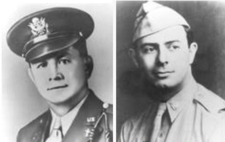
George L. Fox, Alexander D. Goode