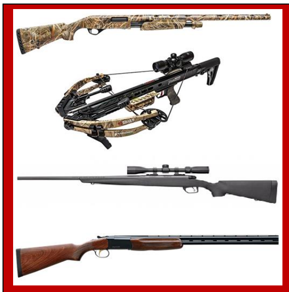
Stoeger P3500 Camo 12 ga., Parker Crossbow, Remington 783 .270 w/scope, Stoeger Condor O/U 12 ga.

All Gun Winners will be required to pass the background check mandated by Federal Law.