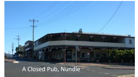
A Closed Pub, Nundle