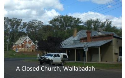
A Closed Church, Wallabadah

to distribute. We encouraged 2 with the Psalm and moved on to Niangala. A appreciated the Psalm and prayer very much, and we gave D at the school our set of children's books, and gave 2 the Psalm. We arrived in Walcha for lunch but they had been hard hit by the people in the buses so would not sell anything to those who were not local. When we put up the book table we were abused by a shopkeeper. We felt this was indicative of the fear generated by the present pestilence around the world. Nevertheless we prayed for 8, gave out 4 Psalm leaflets and our book, 'Living in the Kingdom'. We then drove to Armidale for the night, where we could also buy some food.