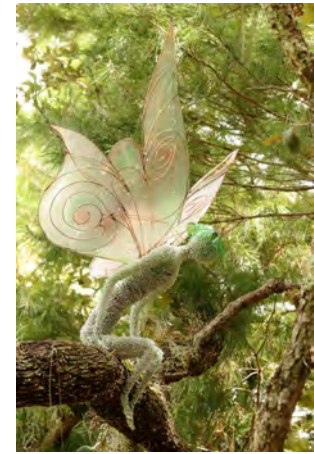
Faeries in a Tree