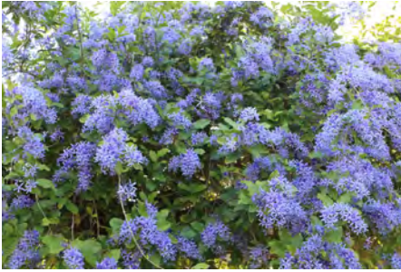
Queen's Wreath in bloom