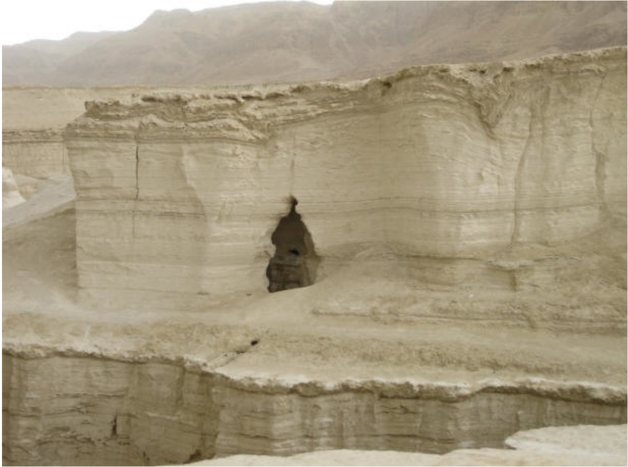
Above: Arched doorway still stands today