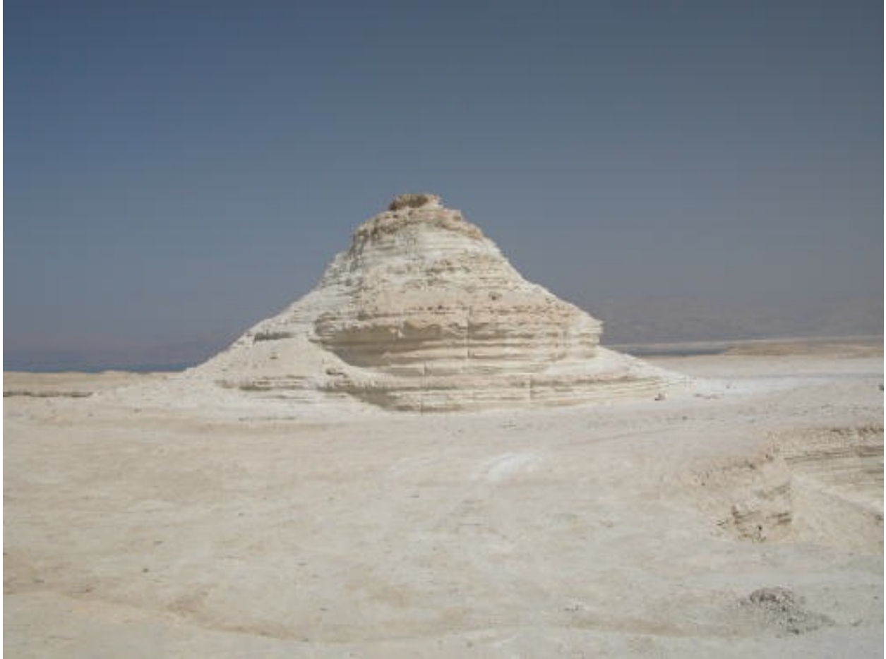
Above: ziggurat shape on raised platform composed of white material