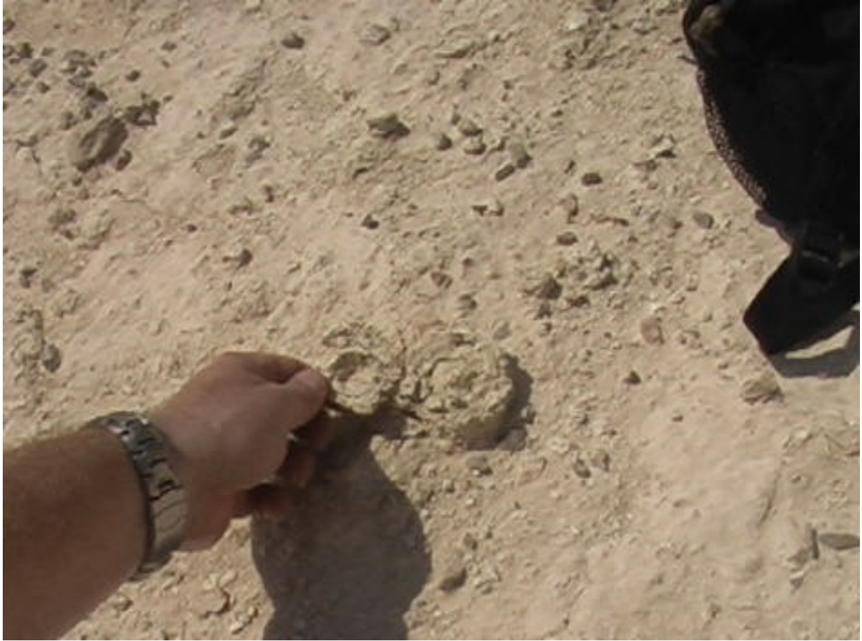
Above: removing the lid from a brimstone shell reveals a round ball of sulfur inside