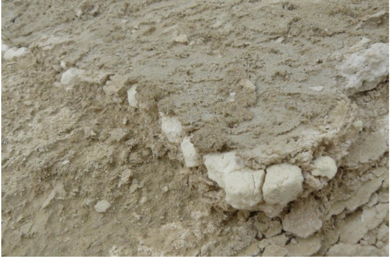
Above: another shot of the brimstone underneath and the crystals on top