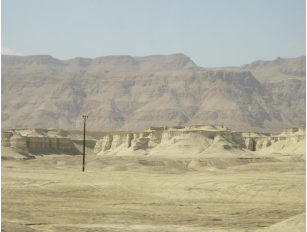
Above: Lighter colored formations can be seen near the Dead Sea.