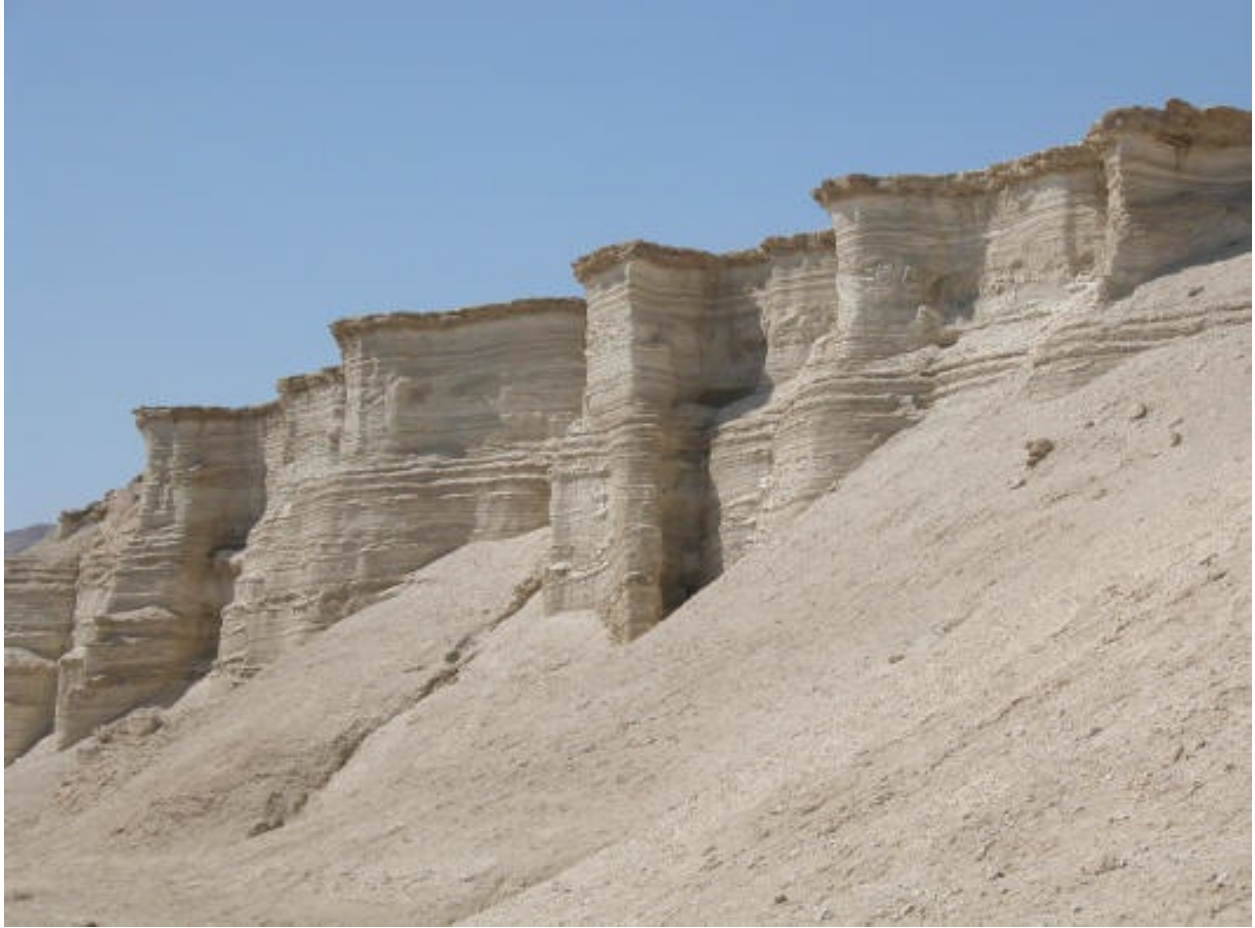
Above: Ninety degree angles extending out from a wall demonstrating unnatural architecture