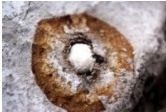
Above: Brimstone with burn ring