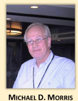
Senior Engineer in Test ACT