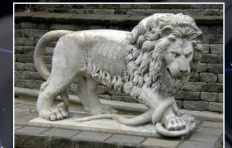
Leo crushing head of Hydra, astrologically.