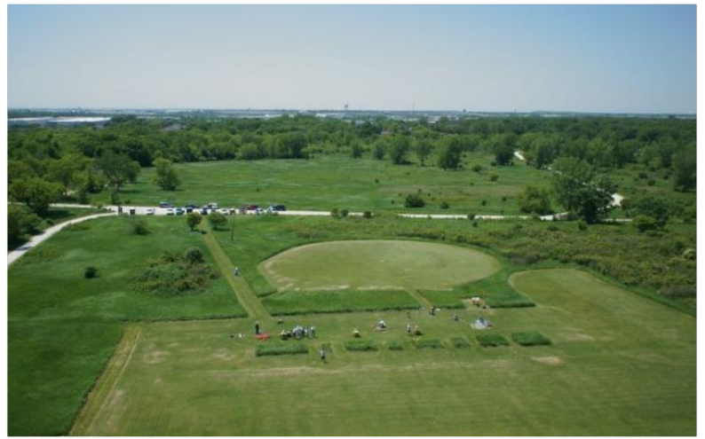
Woodland Aero Modeler's Flying Field at Waterfall Glen Forest Preserve, Lemont, Illinois