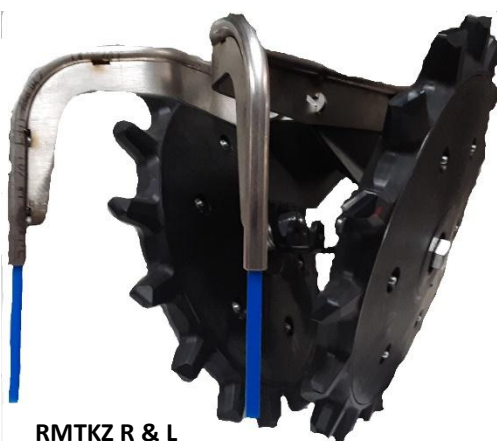
RMTKZ R &amp; L