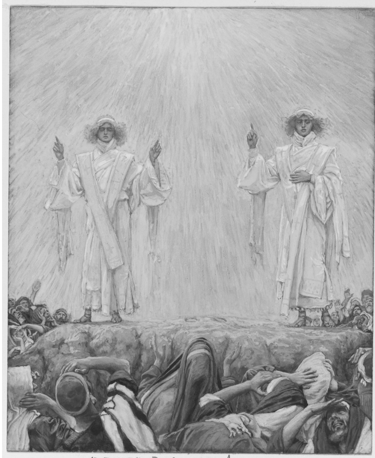
The Ascension, James Tissot, 1886