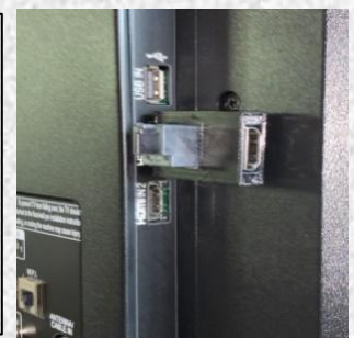
Plugs Directly into TV's HDMI Port