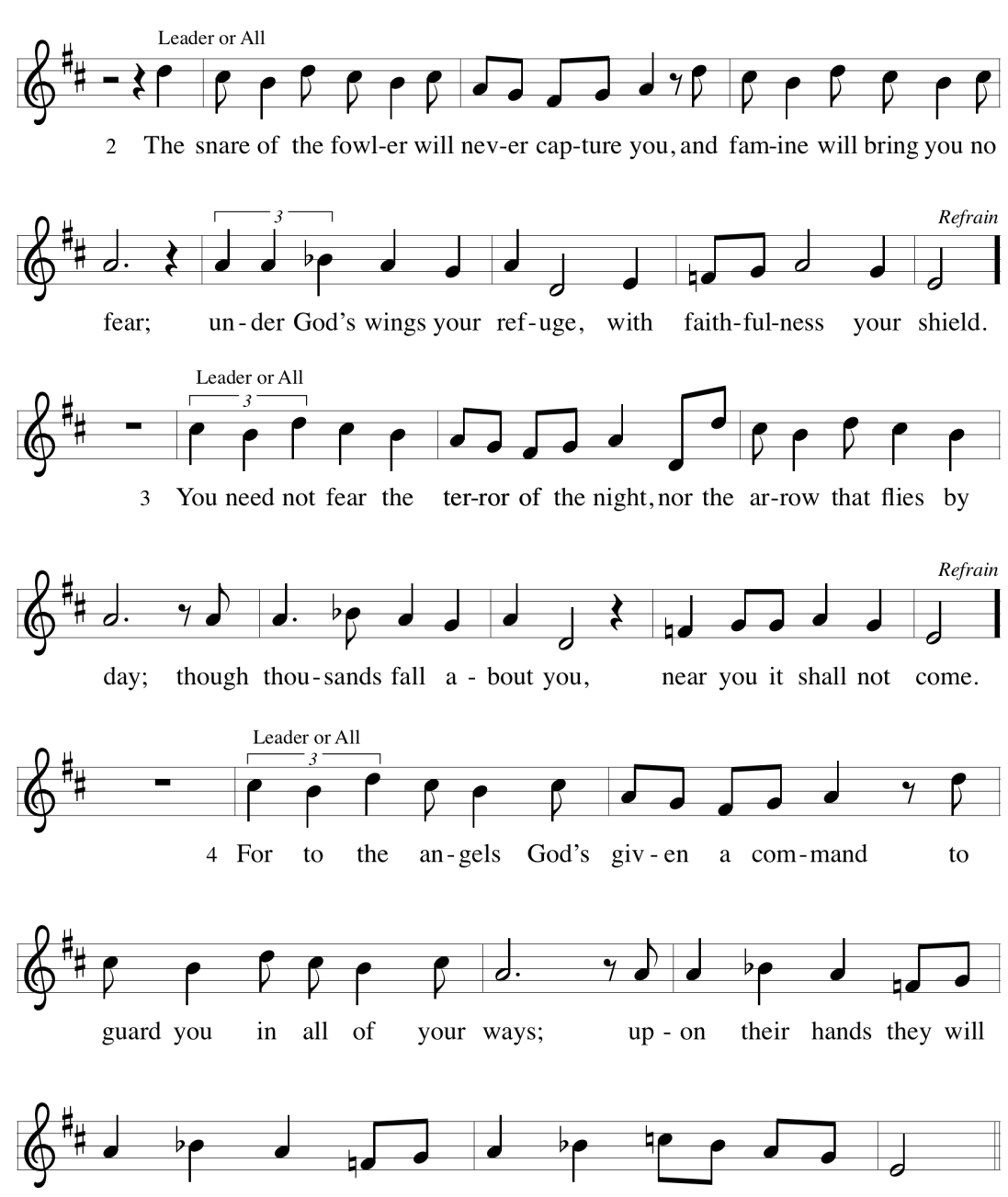
bear you up, lest you dash your foot a-gainst a stone.