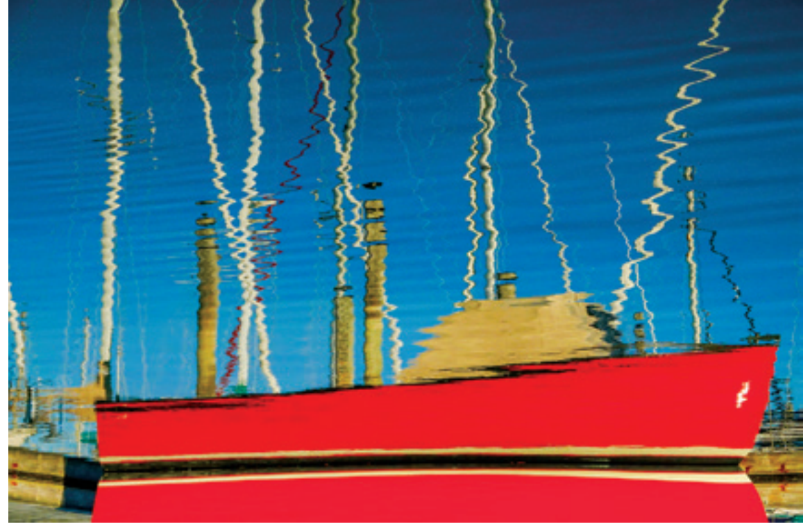
Fishing Boat in Maine

Registration will open on April 1, 2021. Mark your calendar now—PSA Photo Festival, October 6 to October 9, 2021 in Rapid City, South Dakota.