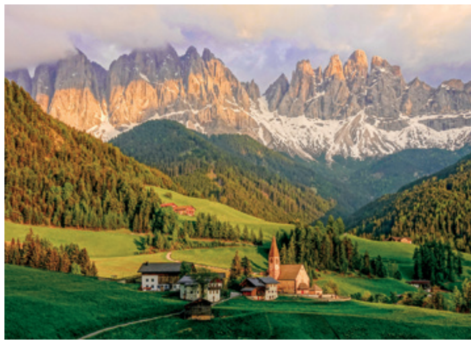
Village Church in the Dolomites