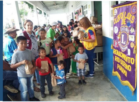
Lions Club Members distribute goods received in Panama

Although distributing rice in Ghana has become a major ministry of the Salvatorian Mission Warehouse, our main focus continues to be on collecting and shipping donated goods to missions in developing nations.