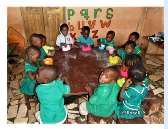
School children enjoying rice from this distribution

I will employ you to consider our requests for rice support to alleviate the plight of this poor people. I would be most grateful if the Salvatorian Mission Warehouse can support us with some Rice for our people.