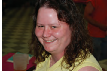
Bonus: Who is this without her hat?