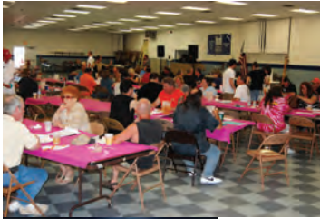
A full house at the IUE hall on Woodman. Showdown and cornhole, raffles and trophies. New officers and old friends!!