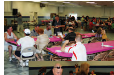
Above: there were trophies and honors for teams and individuals!