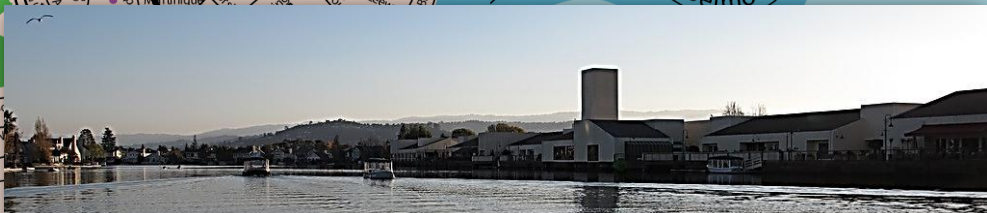
Edgewater Place Shopping Center

Explore the beautiful Foster City Lagoon in a quiet, eco-friendly, and easy to drive Duffy Electric Boat from Edgewater Marine . What a special way to relax with family and friends. Bring your own refreshments and tunes or enjoy take-out from one of our many fine waterfront restaurants. Call (650) 766-9155.