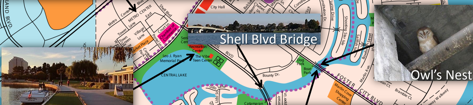
Shell Blvd Bridge