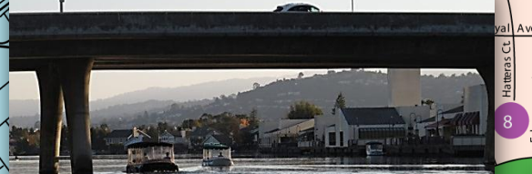
Beach Park Blvd Bridge