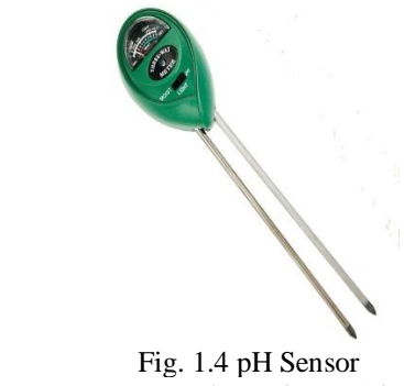
A pH sensor measures the voltage (electrical potential) produced by the solution whose acidity we're interested in, compares it with the voltage of a known solution, and uses the difference in voltage.

pH sensor is used to measure the acidity and alkalinity in the soil. pH value varies from 0 to 14. The soil is said to be acidic if its value is between 0 to 7 and is said to be basic if the value is between 7 to 14 and neutral if it is 7. Whereas, for most of the crops, the ideal pH value remains between 5.5 and 7.