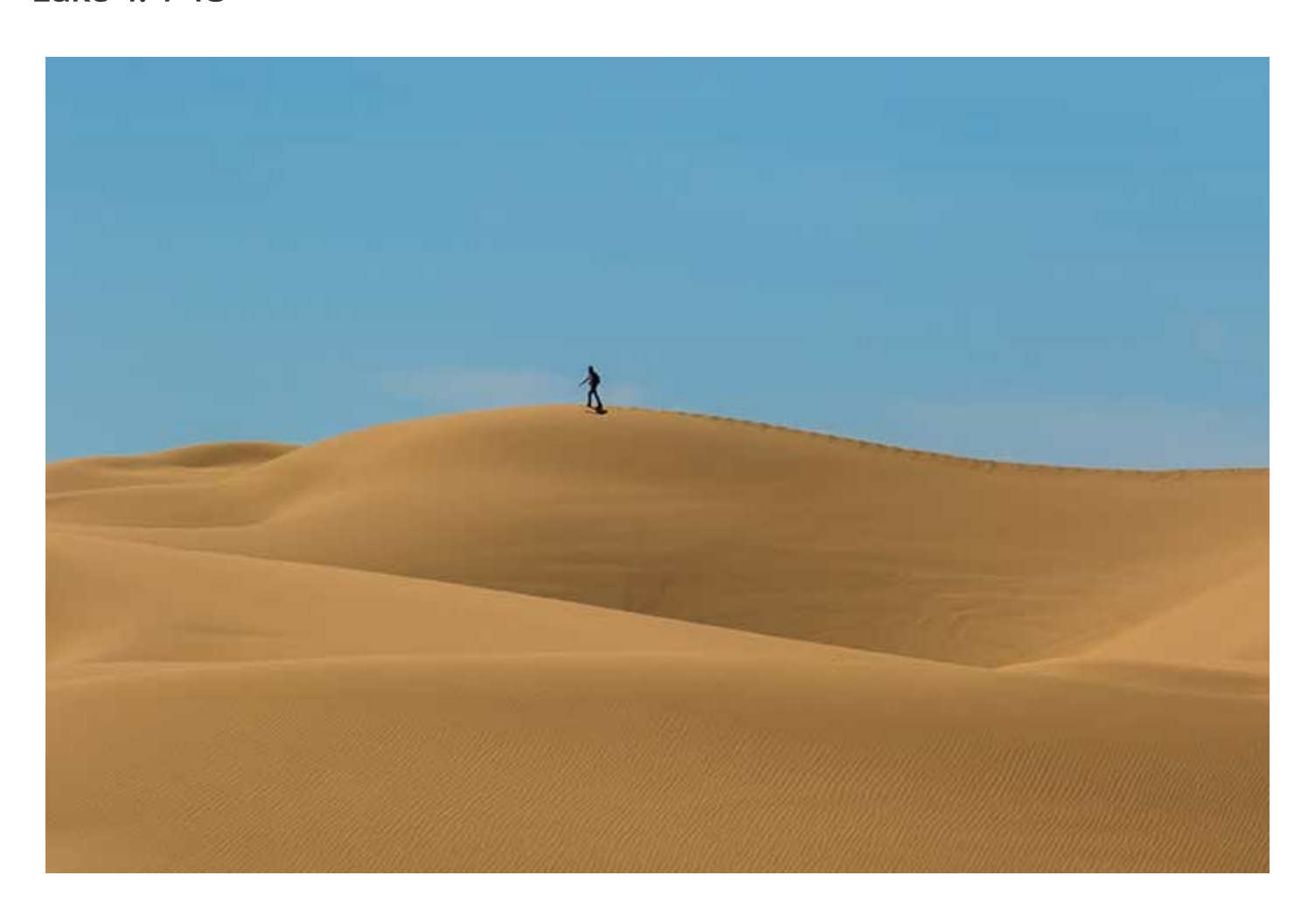
Luke 4: 1-13

The Season of Lent begins with the Gospel Reading of Jesus' temptations in the desert. The Lord ventured out into the wilderness for 40 days - a time He needed to spend alone in the presence of His Father. We imagine that He needed this time - to reflect, to pray, to prepare for the ministry that He came to Live.