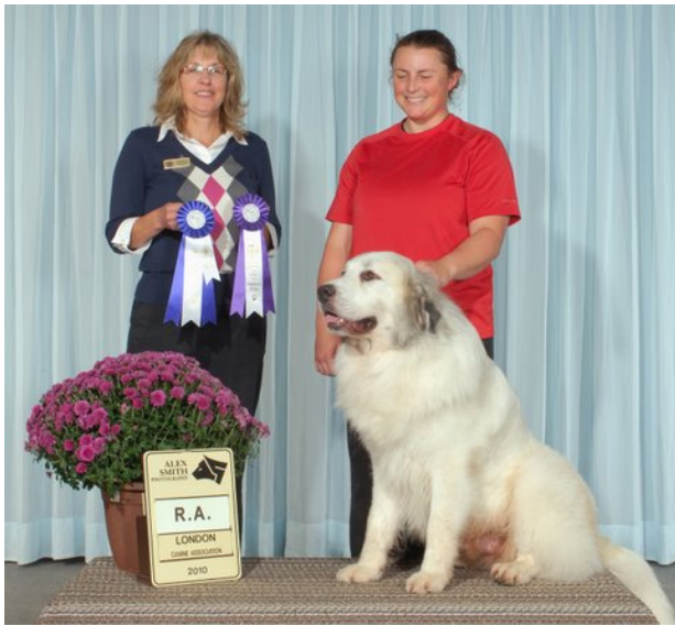
CH. Limberlost Niko RA CGN RNMCL (CARO) DD VX GPCTPOC ( Therapeutic Paws Of Canada) w/ adults & kids with TPOC.