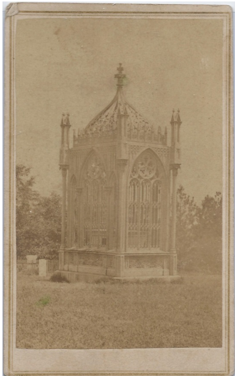
Monroe's Final Tomb – Hollywood Cemetery, Richmond

As the President's second term plays out, intense jockeying is under way to find his successor in office. Three men in particular – John Quincy Adams, William Crawford and Andrew Jackson – will vie for the office, in an election that will, for the second time, end up decided in the House of Representatives.