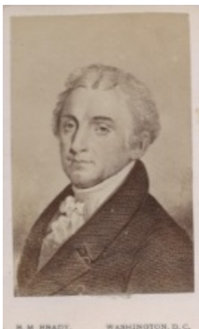
James Monroe (1758-1831)

All cabinet members in place at the end of Monroe’s first term remain in place through the second, except for one turn-over in the Navy post.