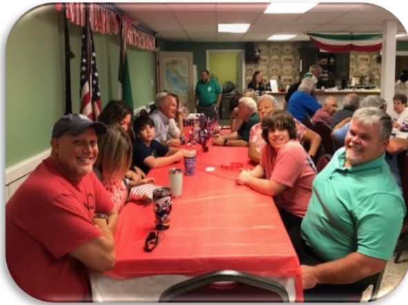
YOUNGER MEMBERS OF THE LODGE ARE READY TO EAT !