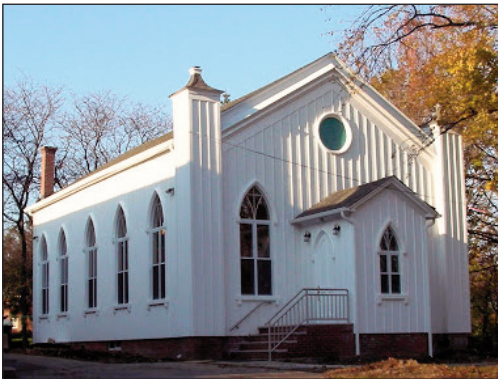
Parish Hall, Built 1881 • Restored 2012