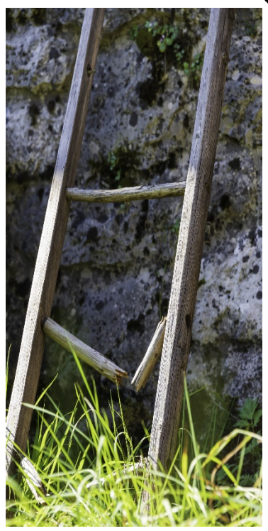
Faith when you are falling