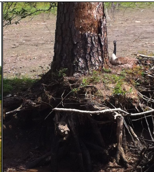
Drought-affected Holding Pond