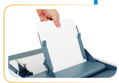
Optional Multi-Sheet Feeder