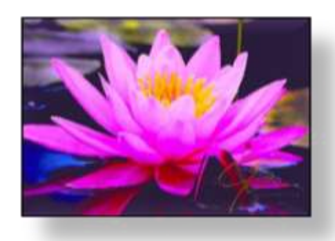
Sing to Me January 23, 2019

Sing to Me Why don't you sing to Me With all your heart And let our love flow freely