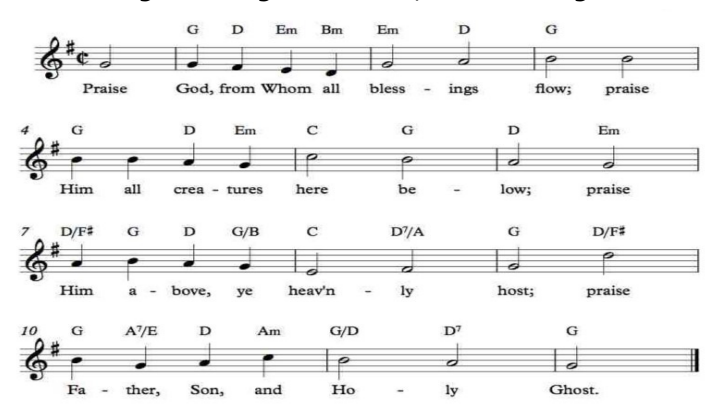
Doxology, written in England for Protestant Churches in 1674.

As the offering is brought forward, we will sing the Doxology.