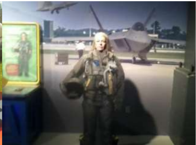
Crystal, Playing at the Museum

I believe this fuselage is an older serial number, but it should be getting finished soon. I believe someone that works for a major avionics manufacturer owns this kit. And below, it looks like there is a Rans S-19 Ventera being built at Lightning Aircraft West. Greg can paint metal planes, too. Pretty paint scheme.