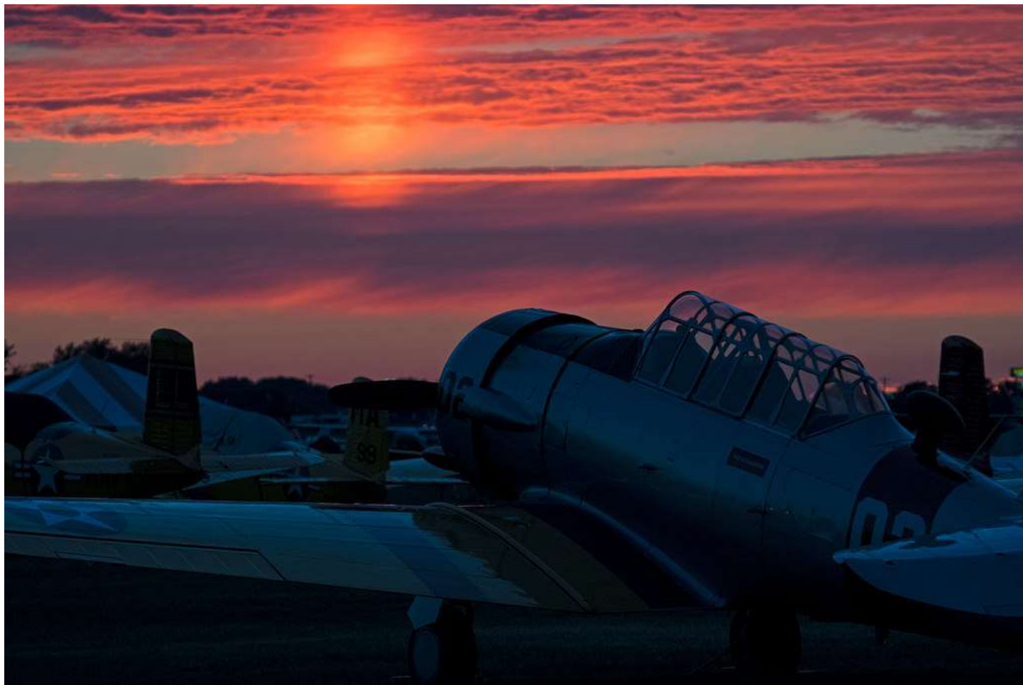
AirVenture 2016 in the History Books

Russia and CIS, AVIA-NIANIA Ltd , Moscow, Russia, Phone: + 7495518-62-75, Mobile Phone: + 7925518-62-75, avianiania@mail.ru or avianiania@aol.com