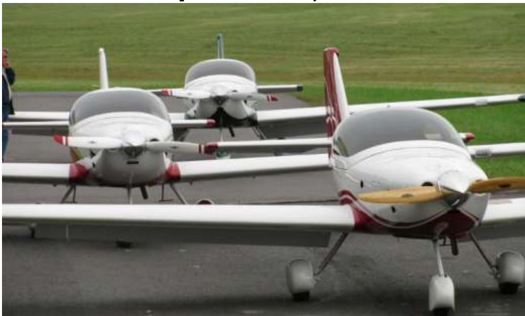
Airport Identifier – KSYI