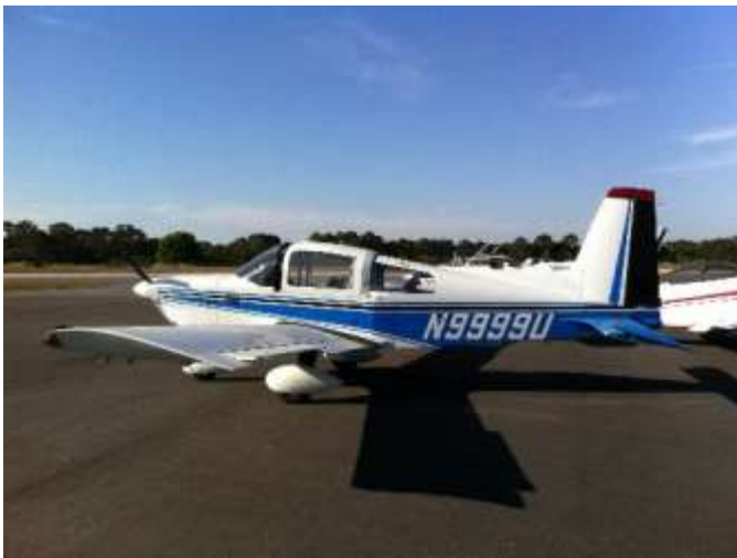
N9999U Our First Plane