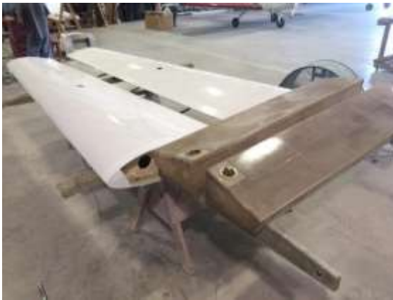
Wings and Tanks

It was great to see Nick and Mark at AirVenture. They have been busy at the factory, too. The newest XS demonstration airframe is in process. All the parts are coming together. It will be nice to see where things are at the Lightning Homecoming (September 24, 2016).