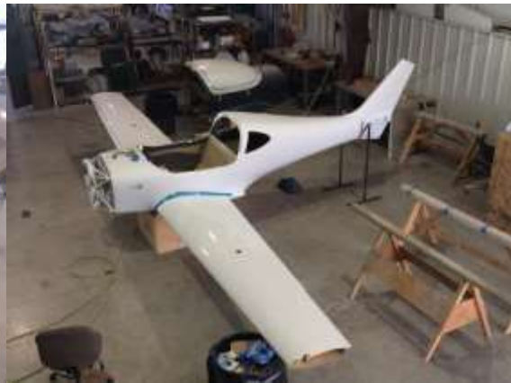
Installed on the Fuselage

How about the new engine mount and the carbon fiber gussets? Changes for the better and lets the Lightning lose a little weight.