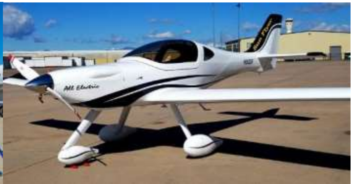
The Sun Flyer