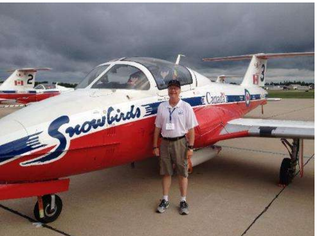
I Got Close to the Snowbirds