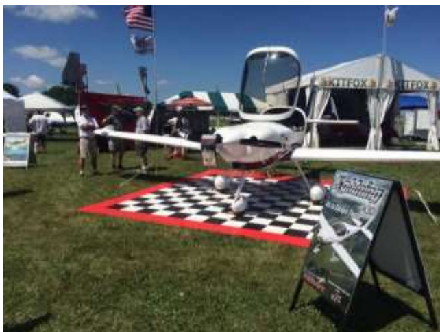
All Set Up and it's Showtime

The Sun Flyer was in the innovation center at AirVenture. It was interesting to look at the airplane in person. Other than the cowl, it looks like a standard Lightning XS. They have not flown the aircraft yet, because the motor manufacturer has not completed development, but soon, real soon. At least that is what I was told when I talked to them at their booth.