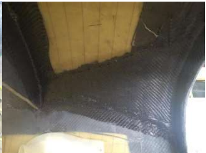
Bottom Gusset on the Left, Top Gusset on the Right

From Arion: Always looking to save weight if possible. We have switched from Steel Gussets to Carbon Fiber. Each attach point is made up of 8 layers of 6k carbon (about 11oz. per yard and thick weave). These of course will bond with the airframe instead of being captured. Weight savings is right at 10lbs.