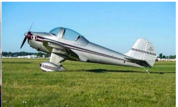
Luscombe S-10 (I've Never Seen One Before)

Lots of nice planes to see and things to do at AirVenture.