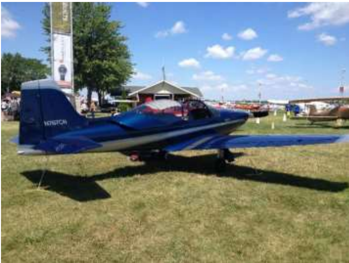
How About a Blue One?