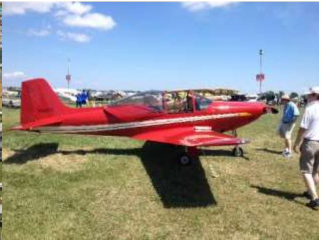
Pretty Red Falco