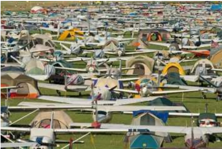
North 40 Parking