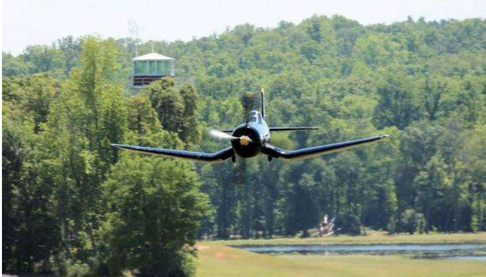
Airport Identifier SC00 / Woodruff, SC