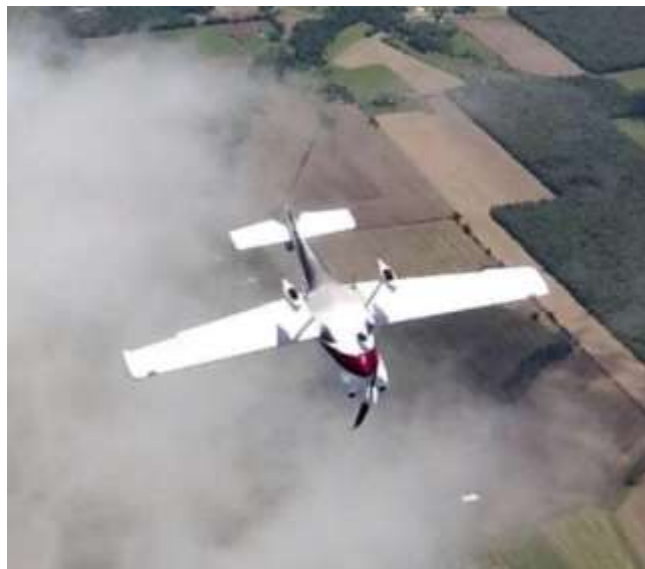
And of Course, You Have to Have Fun