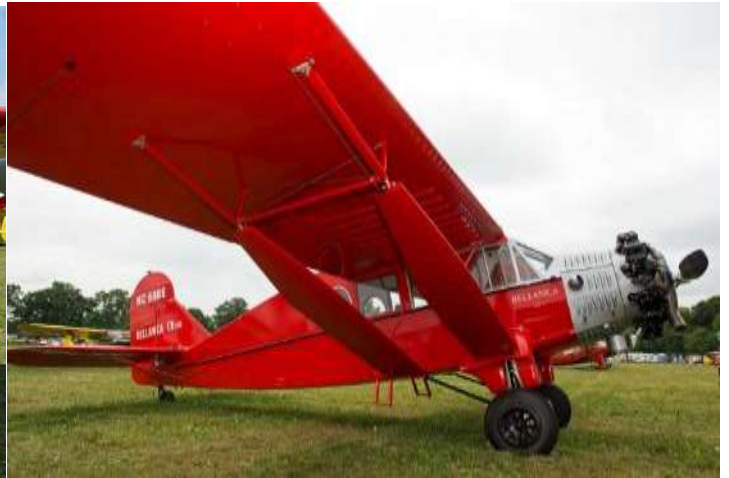
Bellanca CH-300 Pacemaker (Last one flying)