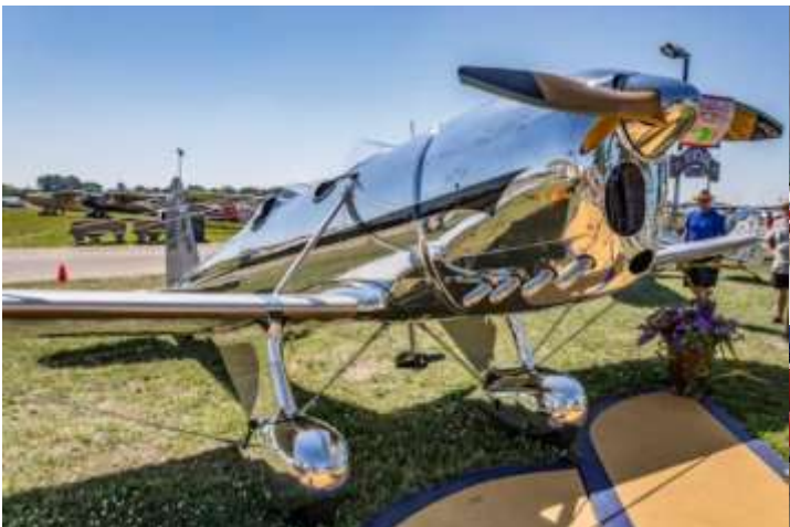
Shiny!! (1936 Ryan ST)