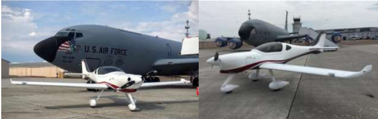
KC-135 and a Lightning XS

The guys also went to The Great Tennessee Air Show in Smyrna, TN. The show was on June 4 th and 5 th . From the pictures, there were a lot of different things to see. I just love air shows, don't you?