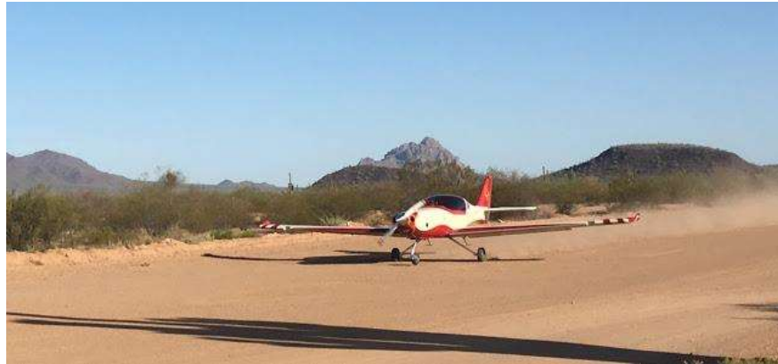
Jack's Jet First Flight

I always like to go poke around on the Lightning Aircraft West blog. You never know what you will find. There are interesting Lightning posts and usually something more. The Hobbs' have been busy the last few months. I believe they will be busy for the next several months as well. I hope to see Greg and Crystal in Sebring for the January Light Sport Expo.