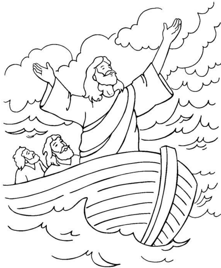
Jesus Calms the Storm

From Thru-the-Bible Coloring Pages for Ages 4-8. © Standard Publishing. Used by permission. Reproducible Coloring Books may be purchased from Standard Publishing, www.standardpub.com, 1-800-543-1301.