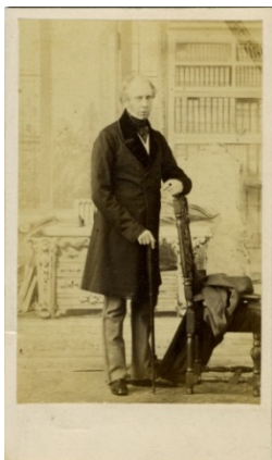
PM Charles Grey (1797-1874)

Passage of the 1833 Act becomes a message of hope for the still nascent abolitionist movement in America.