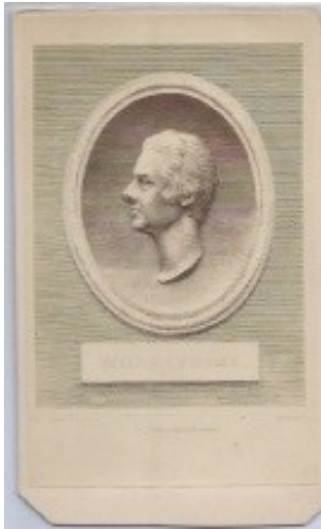
William Wilberforce (1759-1833)

Britain's move away from slavery spans roughly a sixty-year period – beginning in 1772 with a King's Bench ruling in Somerset v Stewart that “chattel slavery was unsupported in English Common Law,” at least in England and Wales.