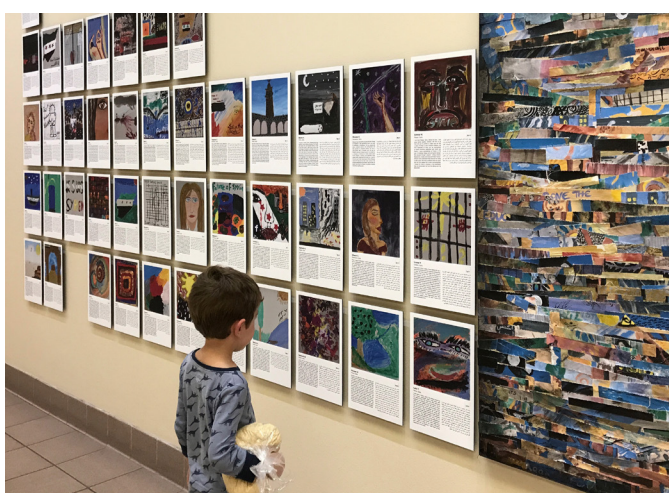
A young child carefully examines the art while holding tightly on to his challa dough.