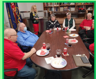
We had a great Christmas party with the Unit and enjoyed the pizza & cake!

Triangle Branch and Unit 182 would like to wish you Happy Holidays!