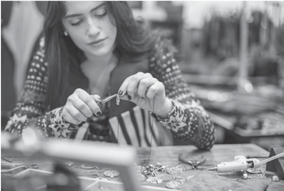
Watch a demonstration or try a hands-on activity at the Handmade Arcade

It's that time of year when you feel the change as well as see it, smell it, hear it, touch it and taste it! It's an energy or vibration-like buzz of all of the activity when you are out and about. It engages all "six" senses!