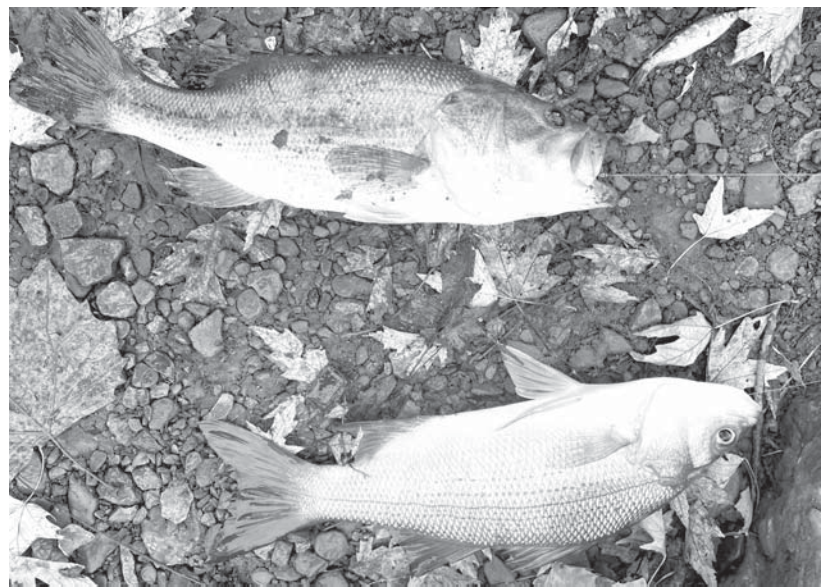
A Largemouth and a Striper from a busy day!

The state has already started to hit approved trout waters in our area with a solid stocking of late-season trout. Canonsburg Lake, Dutch Fork Lake and North Park Lake all have fresh fish if you like to chase the trout. The full run is on for Steelhead up in Erie on the tributaries. Make sure to check the weather closely before you go and dress warm, and make sure you can stay dry. Have a great November, keep those lines tight and send your pictures and stories to samdhall@comcast.net .