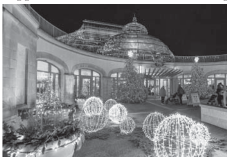
Holiday Magic Winter Flower Show

Phipps Conservatory kicks off the season on Nov. 17 at 5 p.m. with their Holiday Magic! Winter Flower Show and Light Garden and will offer extended night time candlelit hours until 11 p.m. This year is said to be bigger, better and more breathtaking