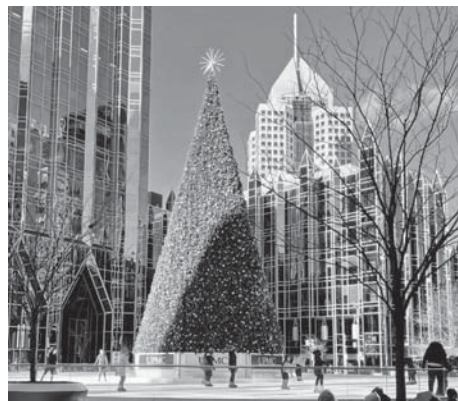
Skating around the decorated tree.

Phipps Conservatory kicks off the season on Nov. 17 at 5 p.m. with their Holiday Magic! Winter Flower Show and Light Garden and will offer extended night time candlelit hours until 11 p.m. This year is said to be bigger, better and more breathtaking