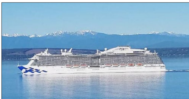
Princess Cruises ROYAL PRINCESS setting sail for Alaska during the 2019 Cruise Season.

Cruise ships will start returning to the Pacific Northwest! Port of Seattle has been working hard to prepare for their arrival. Read more about the Port's efforts for a healthy cruise season here .