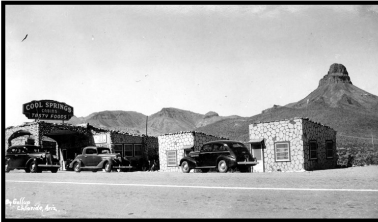
Cool Springs ca. 1940