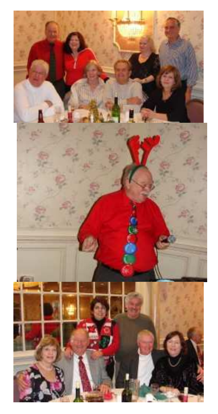
Again for you chocolate lovers, Jan 27th is Chocolate Cake Day while Feb. 20th is Cherry Pie Day.