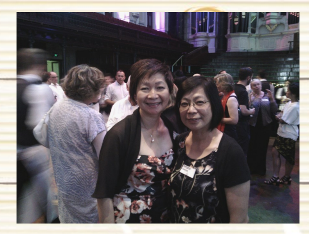
Christmas Reception at Sydney Town Hall