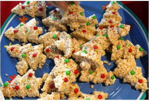
Delineate 2014 Art & Music