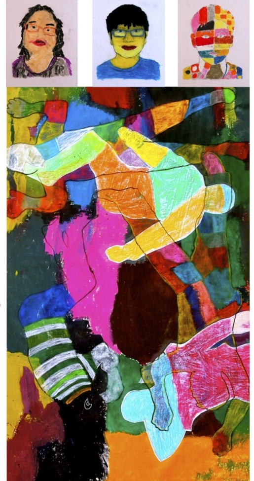
ART & MUSIC - 藝術和音樂