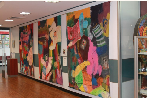
Delineate 2014 Art & Music