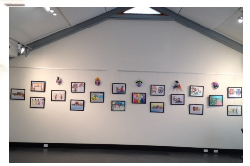
Art Program—Bankstown Arts Centre