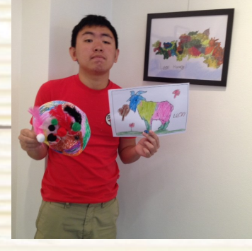
Art Program—Bankstown Arts Centre