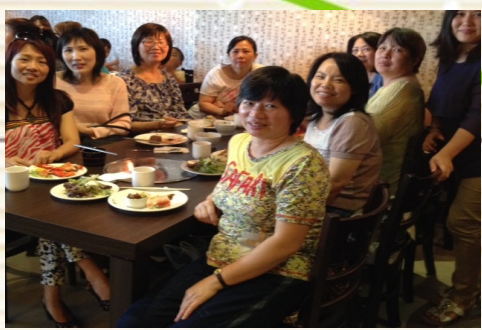
Mum 2 Mum