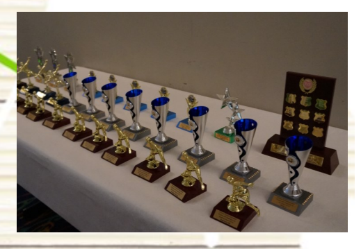
Christmas Party 2014