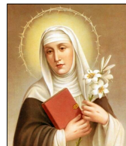
Feast Day: April 29

Sources: franciscanmedia.org and catholic.org