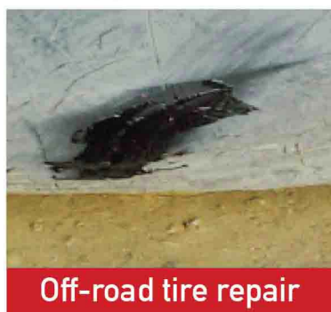
Off-road tire repair

Off-road tires (quarry vehicles, tractors, diggers, graders, etc.), patch linings (chutes, tanks, pipes, and truck beds), rubber / polyurethane screen decks, rubber castings / moldings, marine fenders, rubber lining, watertight sealing, vehicle anti-rollbar repair / rebuilding.