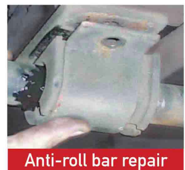
Anti-roll bar repair