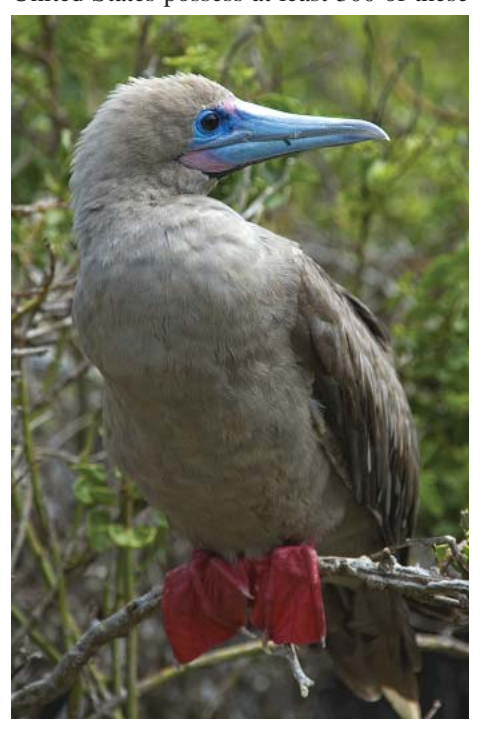
EarthJustice sued to stop military exercises that it claimed threatened the red-footed booby, a bird indigenous to the Northern Mariana Islands.

"Modern diesel-electric submarines pose a significant threat to Navy vessels because they can operate almost silently, making them extremely difficult to detect and track," Roberts wrote. "Potential adversaries of the United States possess at least 300 of these